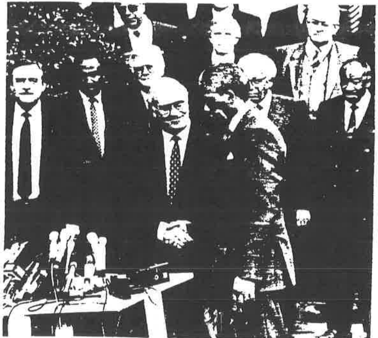
Did the end of white rule in South Africa in 1993 result in a state of nature? Why?

The natural rights philosophy is based on imagining what life would be like if there were no government. Locke and others called this imaginary situation a state of nature . By this, Locke did not necessarily mean people living in a wilderness. A state of nature is a condition in which there is no government. For example, even with the existence of the United Nations, international relations between countries today operate in a state of nature. There is no superior power that can act effectively as a government over these individual states.