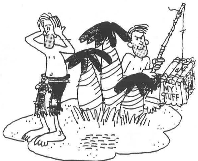
Why did Locke believe it was necessary for people to create governments?