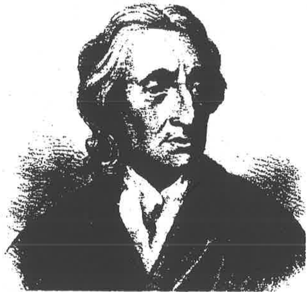
John Locke (1632–1704)

In what ways did Locke's ideas influence the Founders?