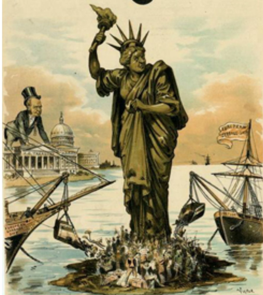
THE PROPOSED EMIGRANT DUMPING SITE.

Published at the Paper Office of New York at Second Street North. Copyright 1890 by Judge Publishing Co.