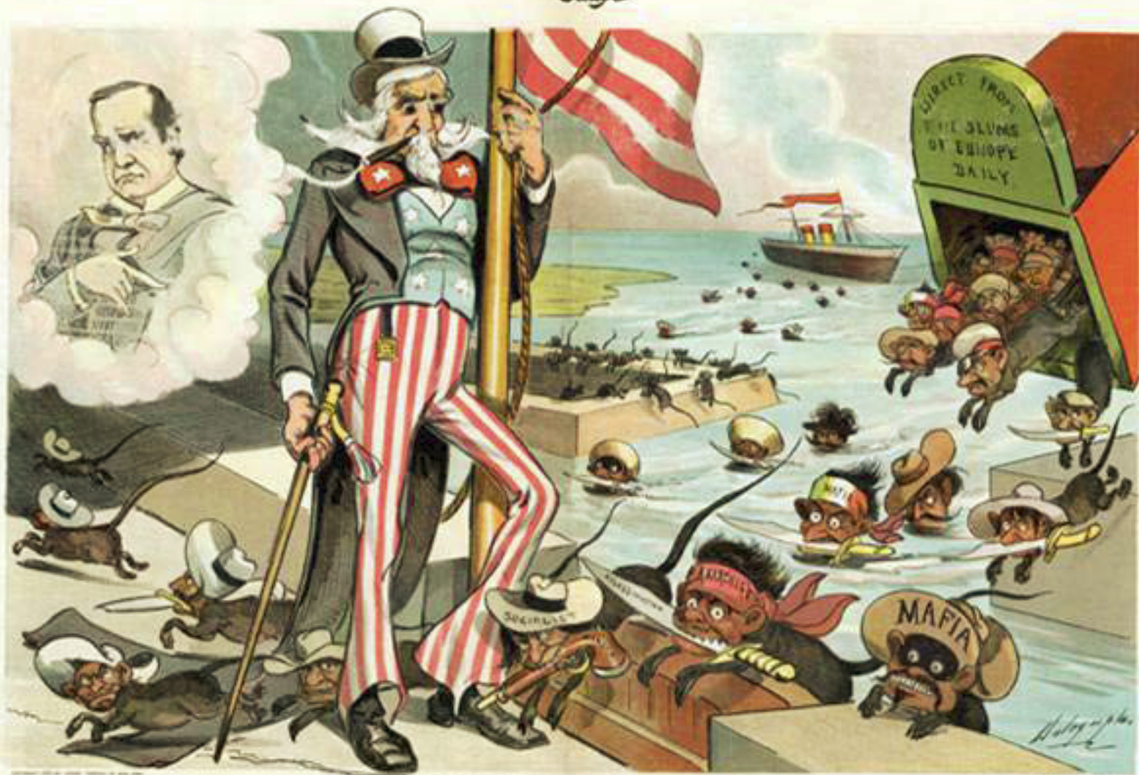
THE UNRESTRICTED DUMPING-GROUND.