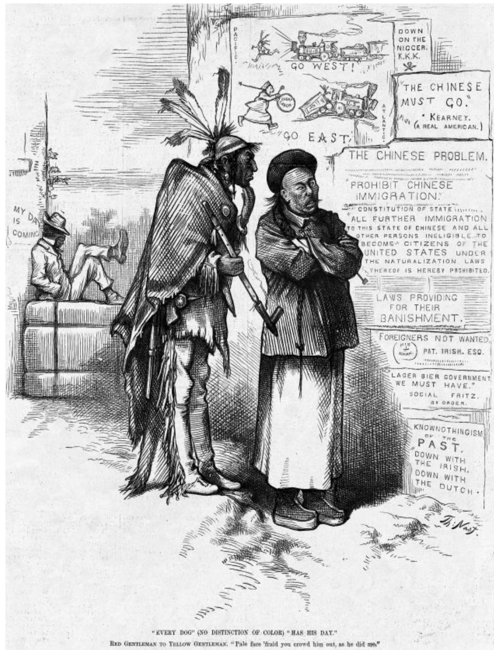
"EVERY DOG" (NO DISTINCTION OF COLOR) "HAS HIS DAY." RED GENTLEMAN TO YELLOW GENTLEMAN. "Pale face 'fruid you crowd him out, as he did me."